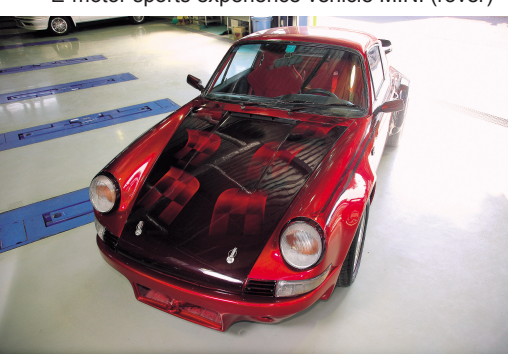
EV conversion Porsche (Porsche)