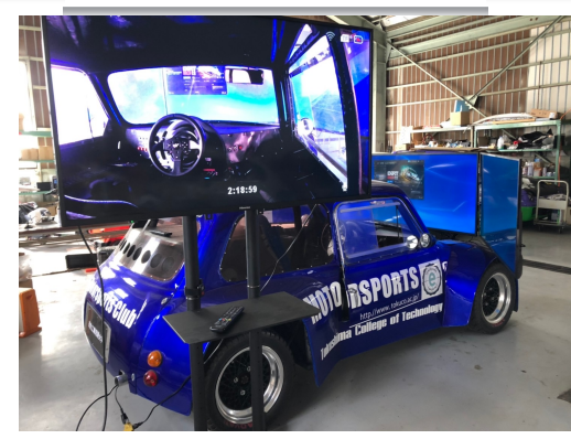
E-motor sports experience vehicle MINI (rover)

Include welcome meeting, birthday party and outing held by the Supporters' Association, as well as support from Japanese students.