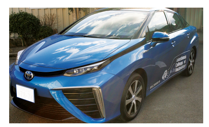
MIRAI (toyota) running on hydrogen energy